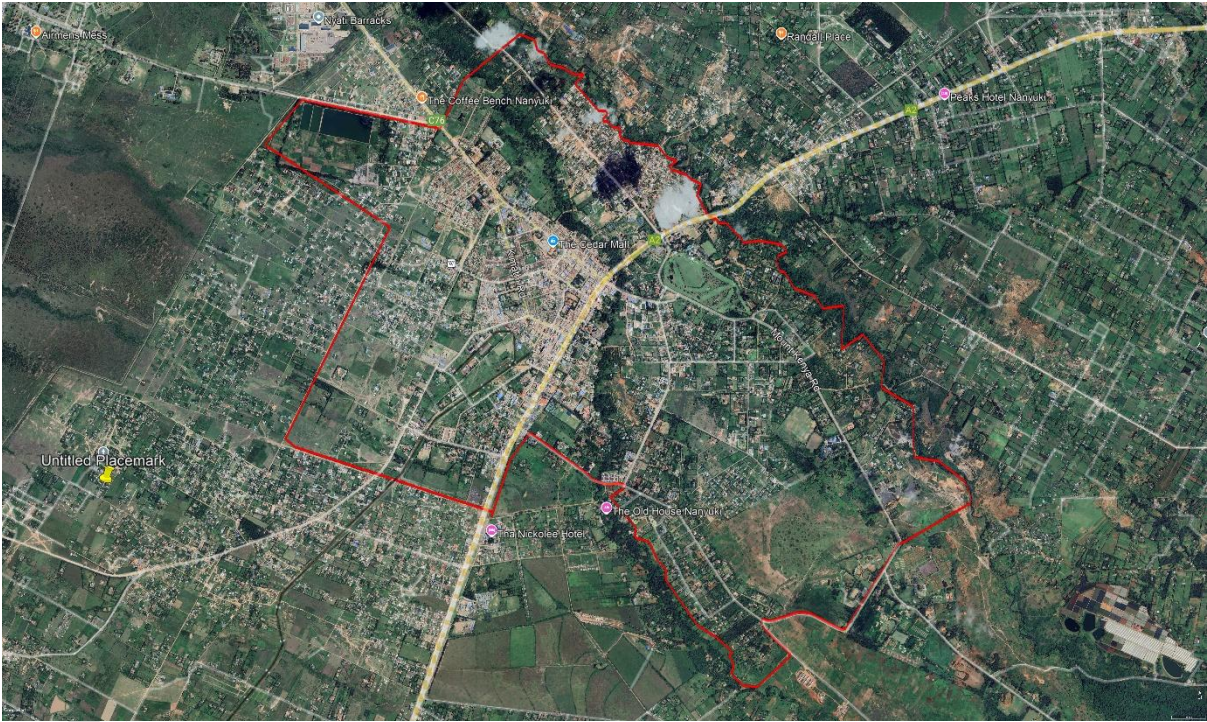
Figure 2: Nyahururu Municipality Boundary